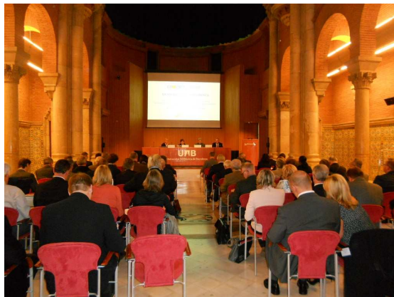
Participants at the DEAN Annual Conference in Casa Convalescencia, UAB, Barcelona

The DEAN annual Conference “ Out of the crisis into sustainable recovery? Maintaining quality at a time of constrained resources ” took place in Barcelona on 15-16 November 2010. The conference was linked to the first EU-Drivers' conference. The conference featured a number of prominent speakers from OECD, the European Policy Centre Brussels and universities to address the issue of the crisis with national examples and institutional responses where the crisis has been most acute, i.e. in Latvia (with a 50 % budget cut in higher education), in Greece or in Ireland. The conference discussed how to maintain quality with constrained resources and respond to the needs of society.