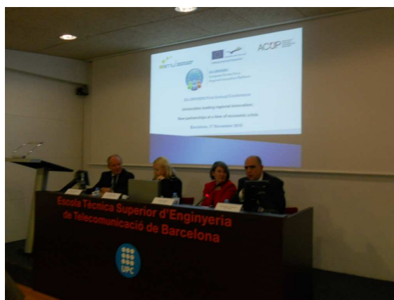
The opening of the first EU DRIVERS Annual Conference in Barcelona on 17 November 2010

The first Workshop took place on the 1-2 September in Brussels and focused on "how to make strategic partnerships work". The second Workshop took place on the 18-19 November in Barcelona, linked to the first EU-DRIVERS first annual conference. It focused on "Resourcing the partnership" (financial matters).