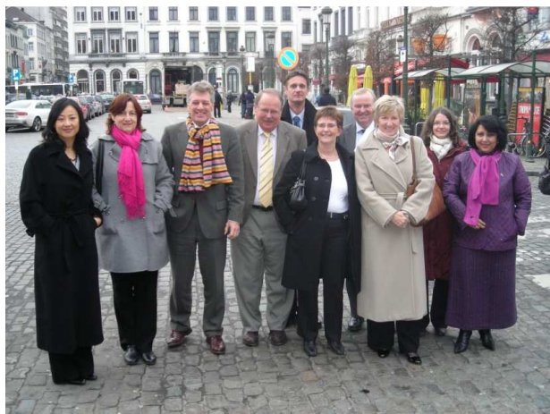
The Steering committee members in Brussels, January 16, 2009

The tours will focus on key EU priority policies (curriculum reforms, governance, quality assurance, university-enterprise cooperation, regional innovation) and their implementation in HEIs, in specific national and regional contexts.