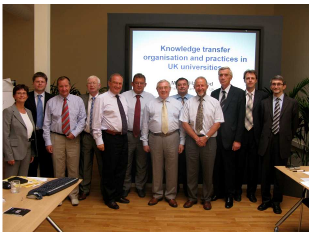
Participants at the workshop organized in Brussels, December 2009

Within the framework of the project ESMU organised a partners' meeting in Brussels on 16 February to review developments with all activities. A workshop for the development of Knowledge Transfer strategic plan in UNN was organized on 20-21 April, followed by a workshop in Dublin (June), a workshop in London (October) and a workshop in Brussels (December).