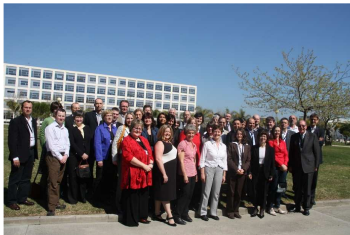
Participants of the seventh ESMU-HUMANE Winter School

The seventh ESMU-HUMANE Winter School for senior university administrators took place in Valencia from 8-15 March 2009.